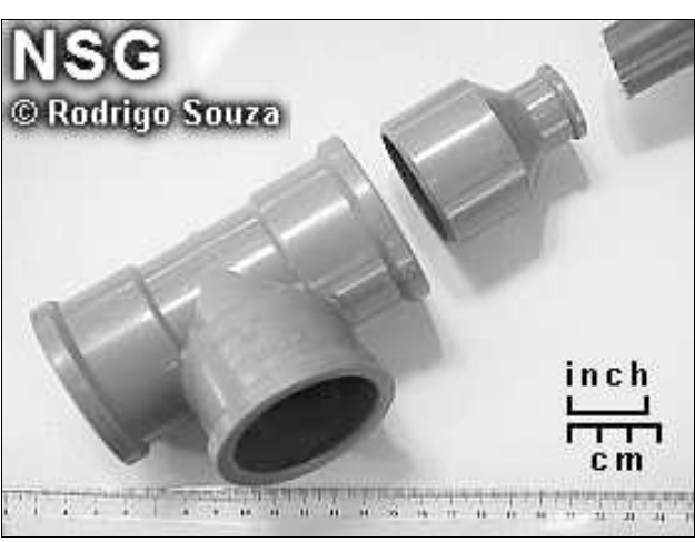
Materials: (1) a 2" or 3" T-joint; (2) a 2" or 3" \times 1" coupling; (3) about 3' of 1" pipe for the handle; (4) PVC glue/cement.